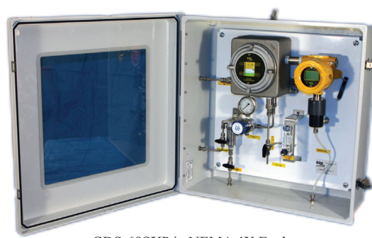
GDS-68SXP in NEMA 4X Enclosure

The GDS-68SXP is designed to be installed in remote, unattended locations. Power usage is less than 10 watts, making solar-powered operation practical and reliable. Automatic calibration allows the GDS-68SXP to periodically perform System Calibration cycles on daily, weekly or monthly intervals. Error conditions are reported as multi-level fault values, allowing remote diagnosis via the 4-20mA analog output or RS-485 MODBUS interface.